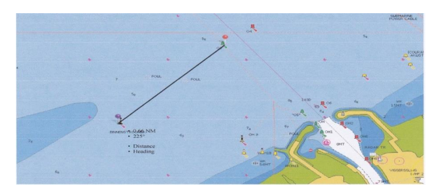
Diagram A (Not to scale and not to be used for navigation)

The Race is the Graham Wallis Trophy race, part of the Offshore Regatta. Results and prize giving will take place at the Royal North Sea Yacht Club, Oostende, on Friday 12<sup>nd</sup> July 2019 at a time to be announced, PLEASE check with the Committee Vessel. There will also be a prize giving for the East Coast Race (28<sup>th</sup> June).